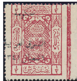
Imperforate between stamp and margin. Also has shabal error (rose)