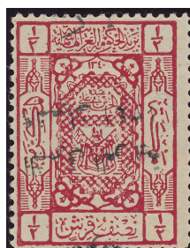
Inverted shifted overprint (rose)