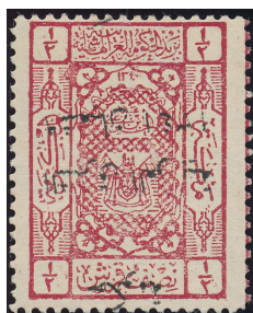
Inverted overprint (rose)

The ½p with inverted overprint exists in both the scarlet and deep rose shades and listed as such in Souan 6 . The former is assumed to be the one illustrated in Najjar 3 and the latter is shown below. The 1p exists with a double overprint and is listed in Gibbons 2 , Najjar 3 and Souan 6 . An illustration appears in Najjar 3 but the black overprint on a dark blue stamp does not reproduce well. Shifted overprints are known and some effectively change the order of the lines.